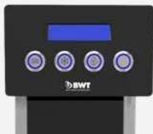
Example of medallion customization (for AQA drink TOWER)